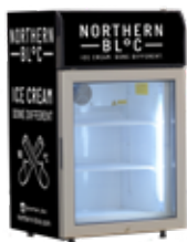
LARGE COUNTERTOP CAPACITY: 156 X 100ml tubs