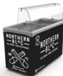
7 PAN SCOOP