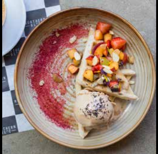
ANNABEL COLE @ FETTLE