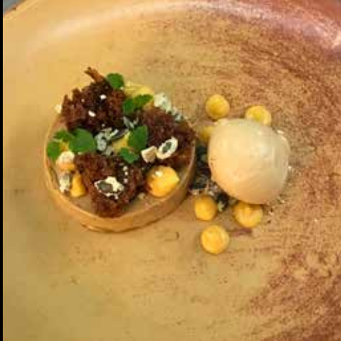
WILL WEBSTER @ SHIBDEN MILL INN