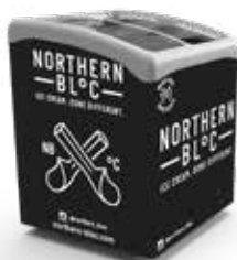
SMALL RETAIL Sliding glass lid